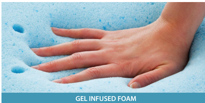
GEL INFUSED FOAM

Gel-infused foams are engineered to improve airflow, release trapped heat and help sleepers stay comfortable throughout the night. Gel memory foam layers are infused with tiny gel particles or beads of thermal gel, which has the inherent property of cooling, to help lower the temperature of trapped body heat.